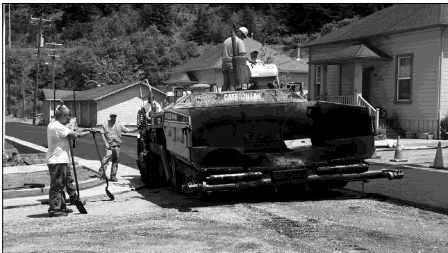
New asphalt concrete paving under way on Eddy Street at Church Street