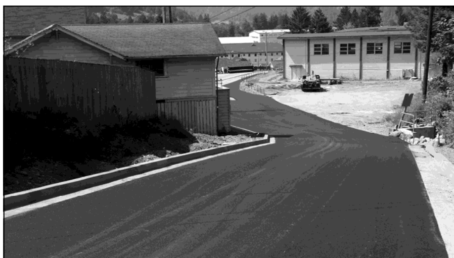
Upper Church Street above the Rec Center at St. Patrick's Church