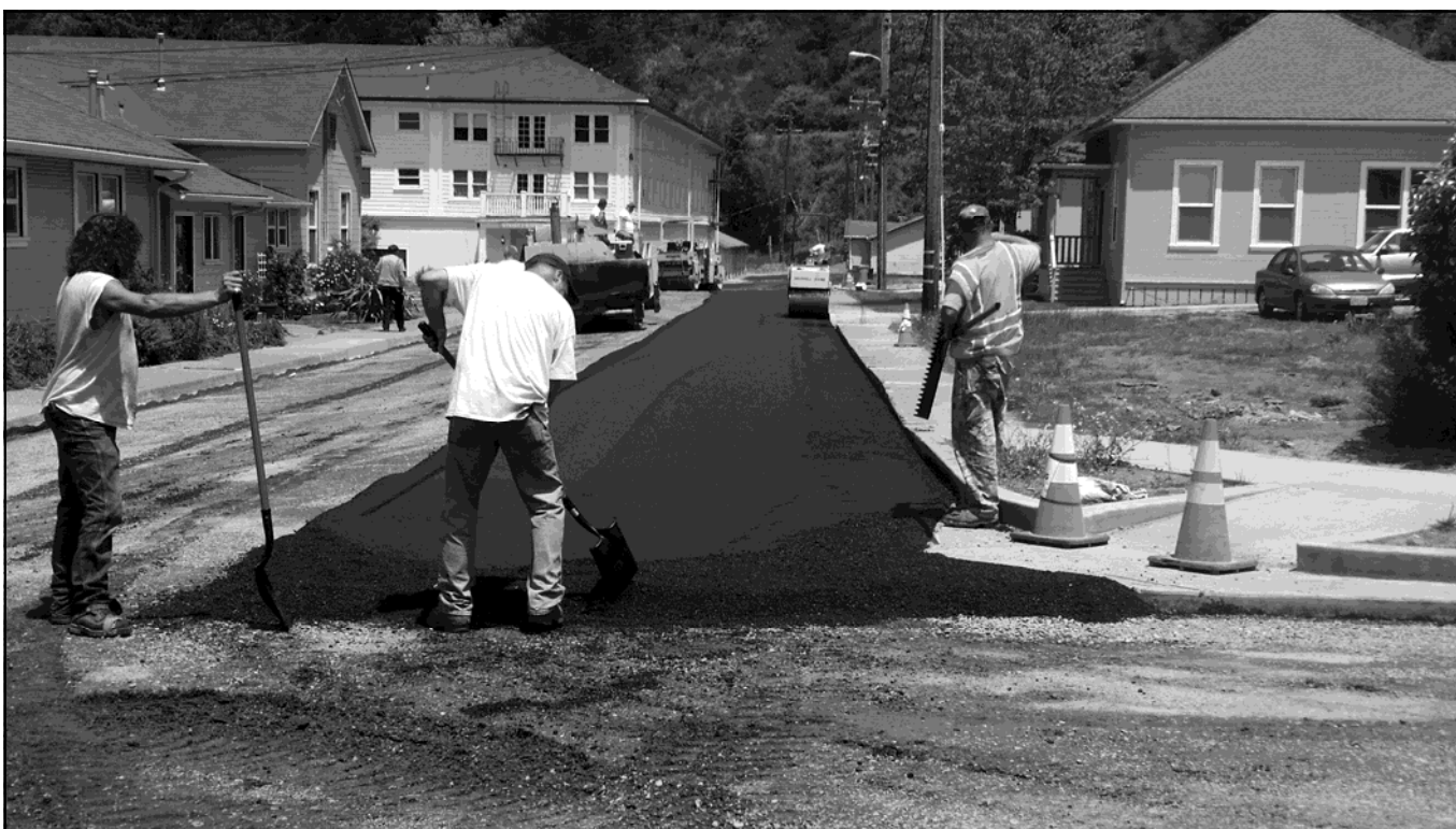
After months of excavation and utility construction, contractors begin the final process of laying down pavement