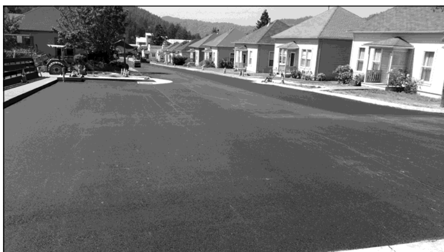
Completed upgrades on Church Street include new curbs, walkways, crossing ramps, water, sewer, storm drains and power